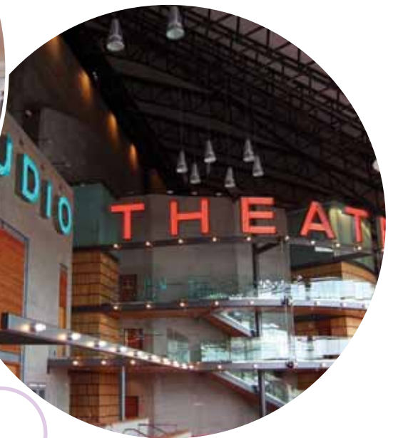
Tempe Center for the Arts