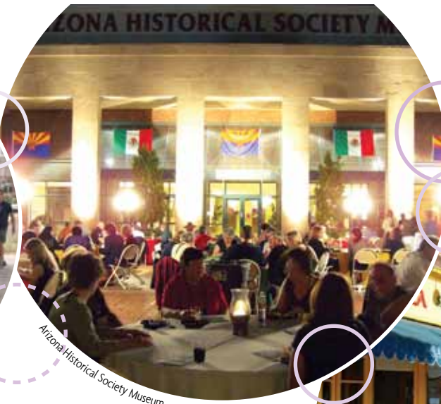
Arizona Historical Society Museum