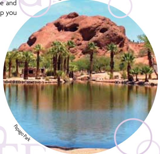
Palo Verde Park

One call to the Tempe CVB is all you need to plan your next meeting or event.