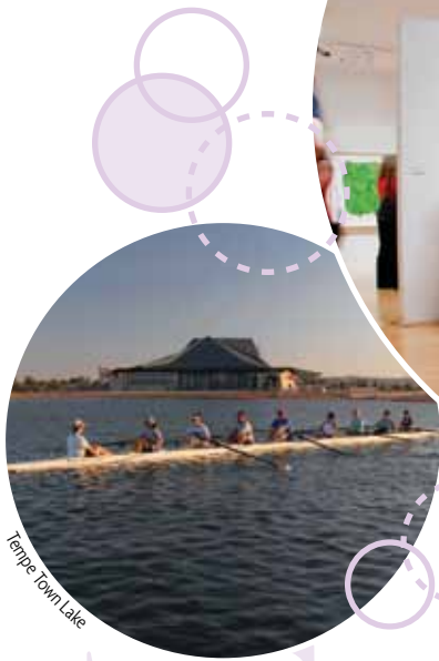
Tempe Town Lake