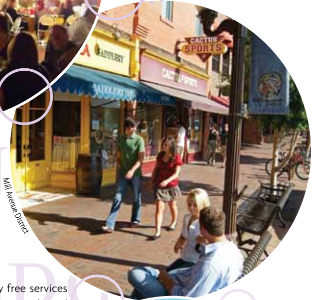
Mill Avenue District