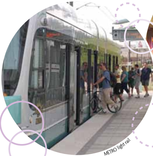
METRO light rail