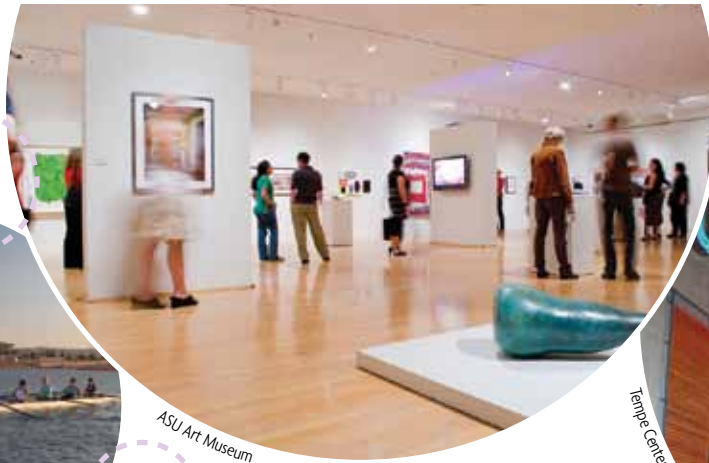
ASU Art Museum